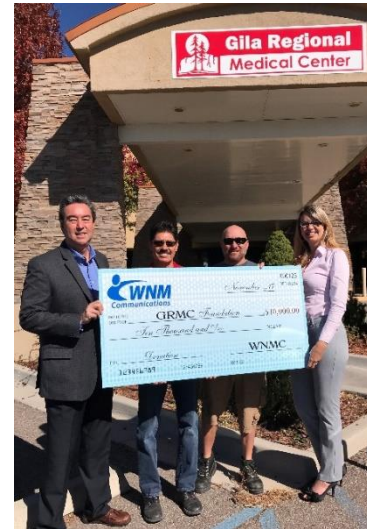
Gila Regional Medical Center was a benefactor of Western New Mexico Telephone Company's designation

and Pals Animal Shelter ♦ Planned Parenthood ♦ Point O Woods Community Fund ♦ Quad City Paws ♦ Rainbow House Domestic Abuse Services ♦ Ringling College of Art and Design ♦ River Bend Food Reservoir ♦ Ronald McDonald House Charities ♦ Rush University Medical Center ♦ Saint Augustine University Parish ♦ Saints Philip and James Parish ♦ Saint Peter of Alcantara Roman Catholic Church ♦ Samaritan's Purse ♦ San Diego Opera ♦ Sanpete Pantry ♦ Services for the Underserved ♦ Shining Schools ♦ Shriners Hospital for Children ♦ Silver City Gospel Mission ♦ Silver City Rotary Foundation ♦ Silver Regional Sexual Assault Support ♦ Spectrum Academy ♦ St. Jude Children's Research Hospital ♦ Straighter Way Foundation ♦ Tango for All ♦ Taste Wise Kids ♦ Temple Judea ♦ The Child Center ♦ The Floating Hospital ♦ The Green Beret Foundation ♦ The Match Foundation, Inc. ♦ The Strawberry Banke Museum ♦ Topaz Museum ♦ Triad School ♦ Trinity Church ♦ Trinity Presbyterian Church ♦ Trout Unlimited ♦ UCSF, Endocrine Surgical Oncology Fund ♦ Unified School District 336 Education Foundation ♦ Utah Cancer Foundation ♦ Utah Domestic Violence Coalition ♦ Utah FNAWS ♦ Utah Food Bank ♦ Warriors Ascent ♦ Watchtower Bible & Tract Society ♦ Whittier College ♦ Wilson College ♦ Young Israel of New Rochelle ♦ Young Life-Tucson Metro ♦ Zacharias Sexual Abuse Center